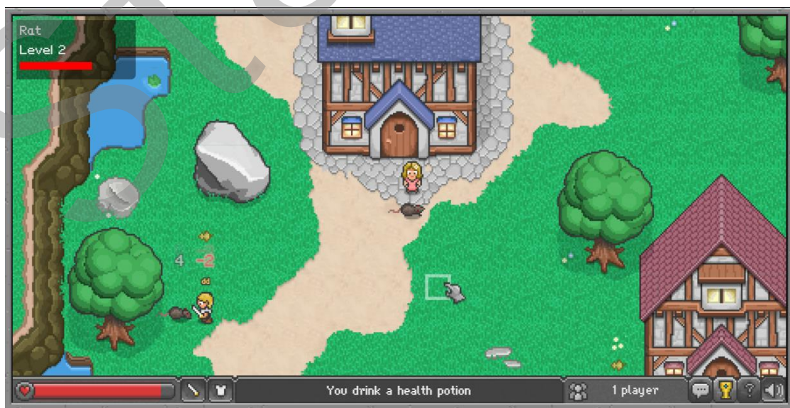
Figure 3-2 BrowserQuest Example Interface