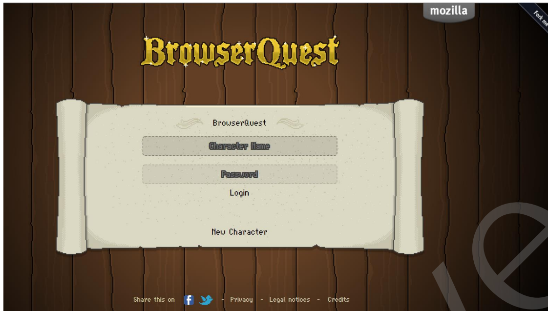
Figure 3-1 BrowserQuest Login Interface